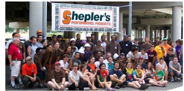
14 student teams from 10 universities in a competition at CSI University in San Antonio

If you are graduating and looking for your first job, use your CSI membership as a stepping stone to a rewarding career. By attending local chapter meetings and networking with construction and design professionals, you'll stay informed about the employment outlook in your area.